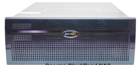
Spectra BlackPearl NAS

“ The idea was to move aging media assets that had not been used in a long time to a storage system with a very low cost. Spectra's hardware infrastructure offered the performance we needed at a great value, with good references and strong system partnerships. ”