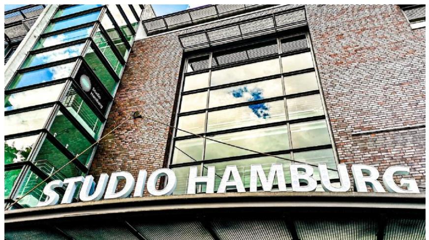
The entrance to Studio Hamburg's headquarters.

After five years of operating, it was time for the existing storage infrastructure to be adapted to suit this continuous data growth. Studio Hamburg wanted a hybrid and scalable solution that could provide a central archive across their