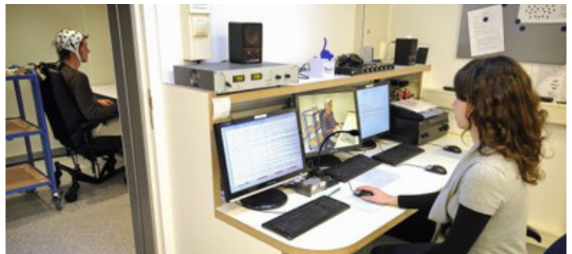
An EEG lab research session at the institute

MPI selected a Spectra® T950 Tape Library with LTO-7 tape drives and media to replace the Quantum Scalar i2000. The T950’s industry-leading density and compact design made it the ideal fit for the institute’s data center, consuming minimal floor space and resources. As their data grows, MPI can easily and